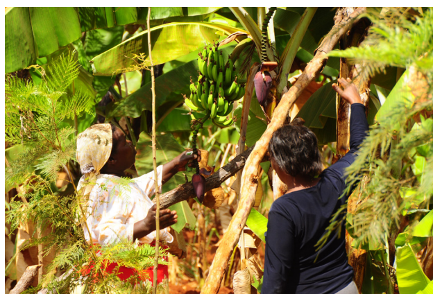
Local female farmer from Karurumo village, Kenya

Southeast Asia is, consistently, the most successful region of the developing world in terms of economic growth and poverty reduction. In 1960 its inhabitants were on average much poorer than Africans; today they are two and a half times richer. In Southeast Asia this entire half century has been one of continuous growth, apart from a brief hiatus at the turn of the millennium caused by the Asian financial crisis. In Africa per capita income stagnated in the 1970s, declined in the 1980s, grew weakly in the 1990s, and today is still barely higher than in 1975 (Figure 1).